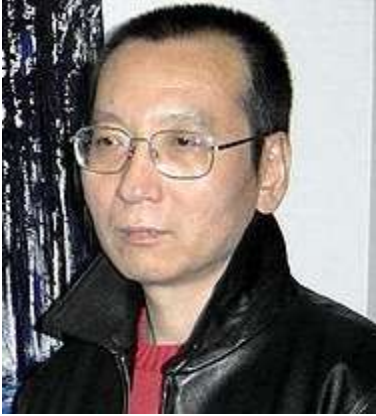
Fig. Chinese dissident Liu Xiaobo

The political side of the Peace Prize became evident when the 2010 prize was awarded to Chinese dissident Liu Xiaobo who had no known contribution to Peace, rather an opponent of guaranteed basic Human Rights for 1.2 Billion people of China. NATO/US support for dissident like Xiaobo only exposes their fragile feudal democracy loyal to Constitutional Monarchy and Corporate Autocracy perpetuating humiliating unemployment, homelessness, crimes, inflation, and