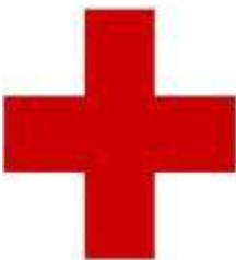
Fig. Red Cross Emblem

change the German flag resembling Cross 21 twice in 1919 and 1948. The very first prize was given to the founder of Red Cross 18 (Flag of England) and proponent of the Jewish State in Palestine supported by then Monarchial Union. Thus behind all humanitarian gestures Red Cross 22 (The English Flag) can be seen as the allied military hospital in war zones to minimize allied casualty! In other words