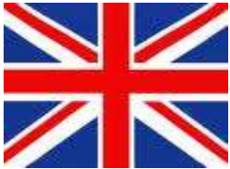
Fig. British Flag

The most important incident that happened since Nobel's death in 1896 was that Norway became Monarchy tied to Demark and England in 1905 severing union with Sweden.