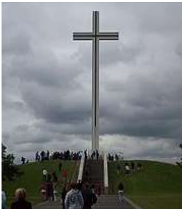
Fig. The Papal Cross in the Phoenix Park, Dublin

With Swiss-Cross, English-Cross, Nordic-Cross, Red-Cross playing important role in the Nobel peace prize it won't be out of context to analyze whether Papal Cross 41 could gain grounds from the awarding of the peace prize, at least in few occasions!