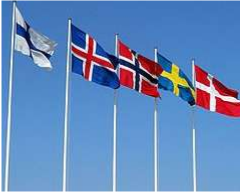
Fig. The Nordic flags. From left to right respectively; the flag of Finland , Iceland , Norway , Sweden and Denmark .

World Health Organization, United Nations, Red Cross. The International Court of Justice 64 is in Monarchial Hague, Netherlands.