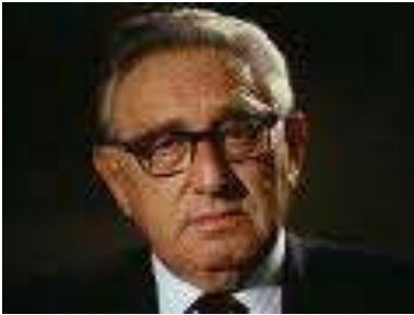
Fig. Henry Kissinger

Henry Kissinger, who orchestrated the worst chemical weapon attacks 33 in the villages of Vietnam, Laos, and Cambodia, is an ideal example of the political side of the award.